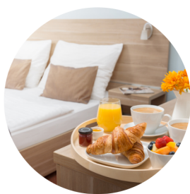
Hotel Discount: up to 60% off

NAIT has long-term partnerships with providers that share its dedication to the industry. We have worked with our members to develop association benefits to meet their needs.