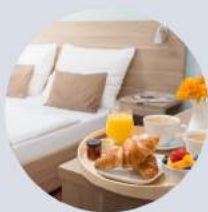
Hotel Discount: up to 60% off