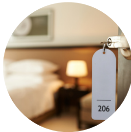
Hotel Discount: up to 60% off

NAIT has long-term partnerships with providers that share its dedication to the industry. We have worked with our members to develop association benefits to meet their needs.