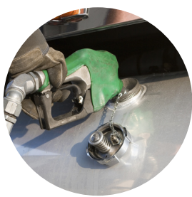
ZERO-FEE Fuel Card