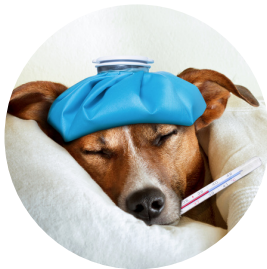
Pet Care Telehealth